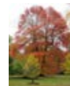
Original photo-no sky

Cover picture in Sheffield Park The sky was added at a Digital Photography group meeting