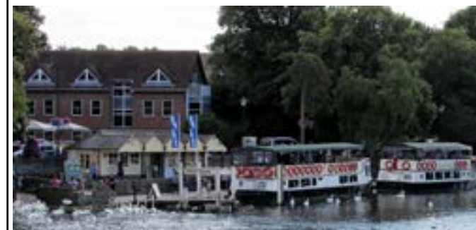
on the Thames