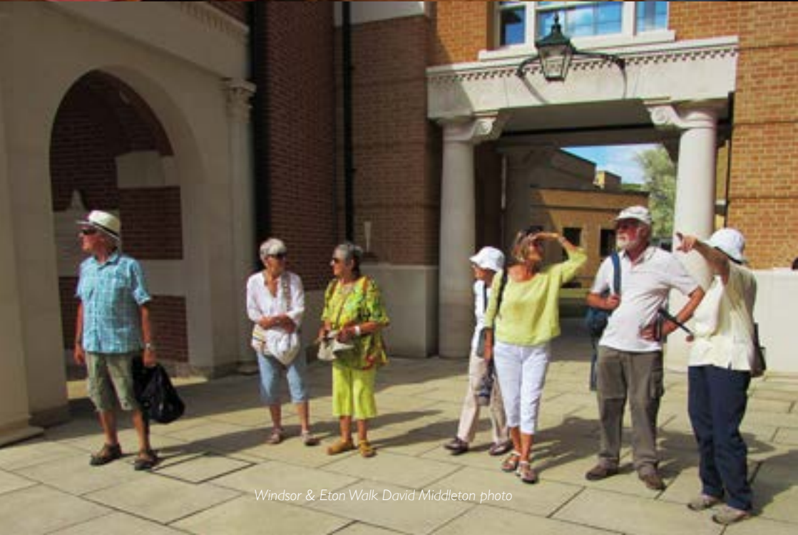
Windsor & Eton Walk