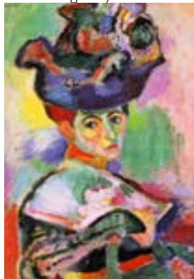
the lady with the hat

Every time we go to San Francisco we always try to get to the Museum of Modern Art to see 'the lady with the hat' which is a portrait of his wife and its very