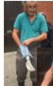
searching for a captured bird

them, take them out carefully holding the head between the index and middle finger; (which is the safest and most secure way to hold a small bird) so they can inspect the captive, record its species,