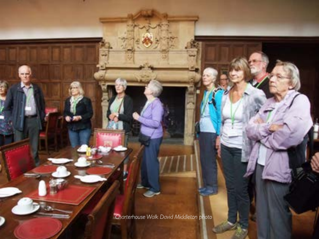
Charterhouse Walk