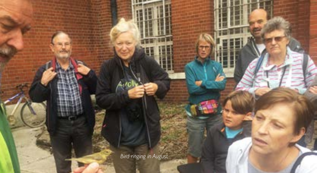
Bird ringing in August